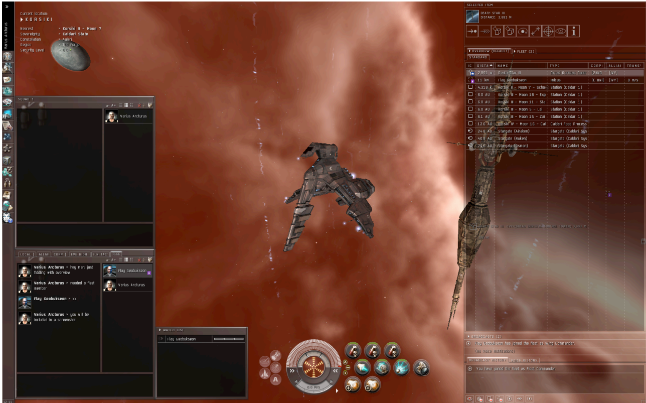
This is what my screen generally looks like during a fleet op.

Another hint - You can move your targeted objects around your screen as well. Notice that above your targeted items (you will have to target something to see these), there is a very faint crosshair. Click and drag that crosshair around to change the location of your targets.